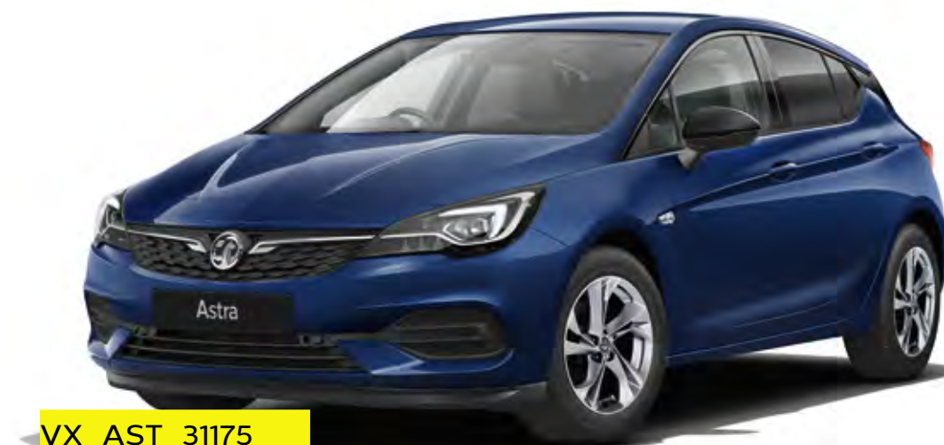
Navy Blue (G4B)** Two-coat metallic paint £550