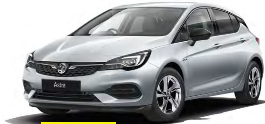
Sovereign Silver (GAN)* Two-coat metallic paint