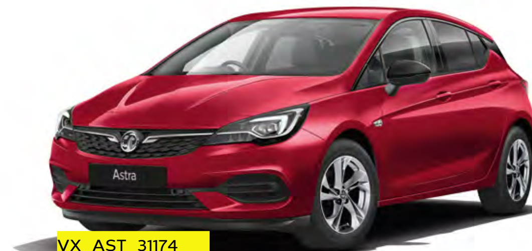
Hot Red (G1R)** Two-coat premium paint £650