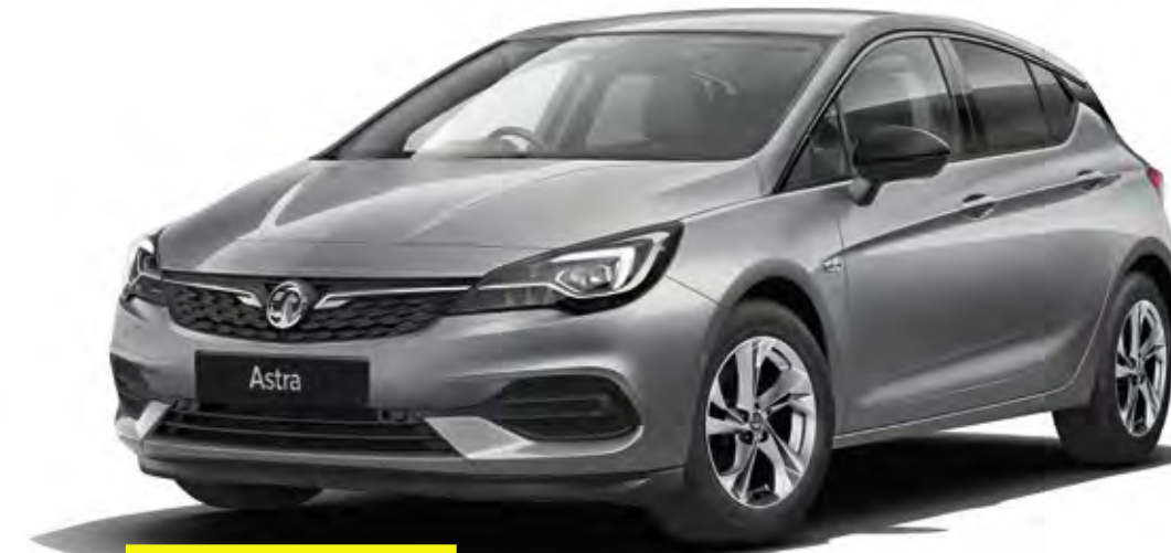
Cosmic Grey (GF5)** Two-coat metallic paint £550