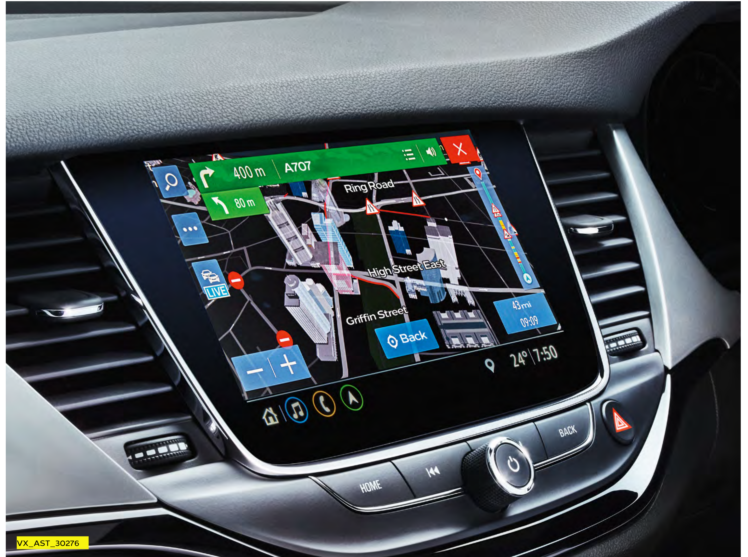
7-inch colour touchscreen.