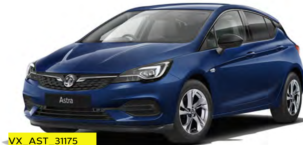
Navy Blue (G4B)†† Two-coat metallic paint £550