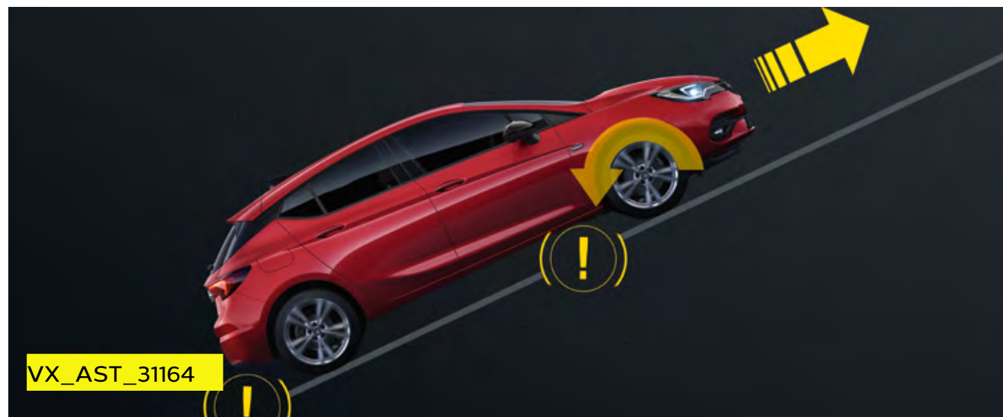
Hill start assist.