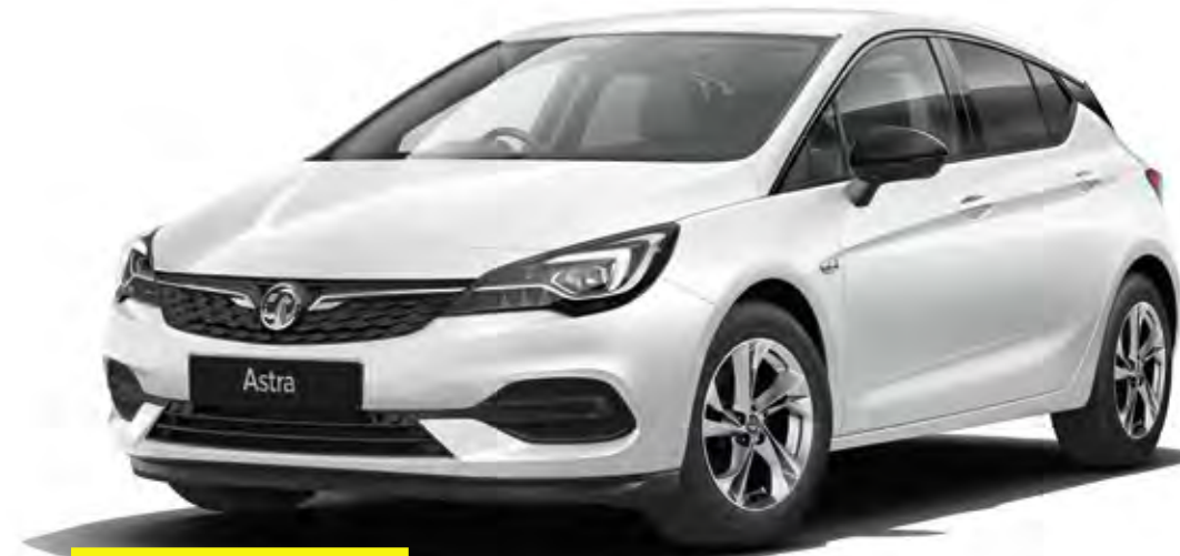
Summit White (GAZ)** Brilliant paint £320