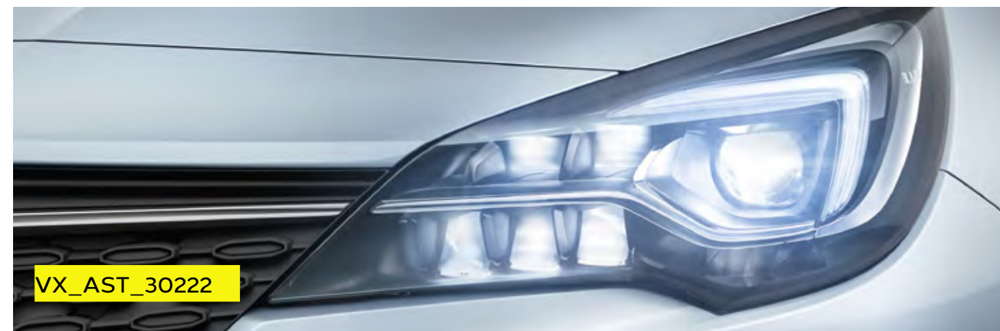
IntelliLux LED® Matrix headlight.