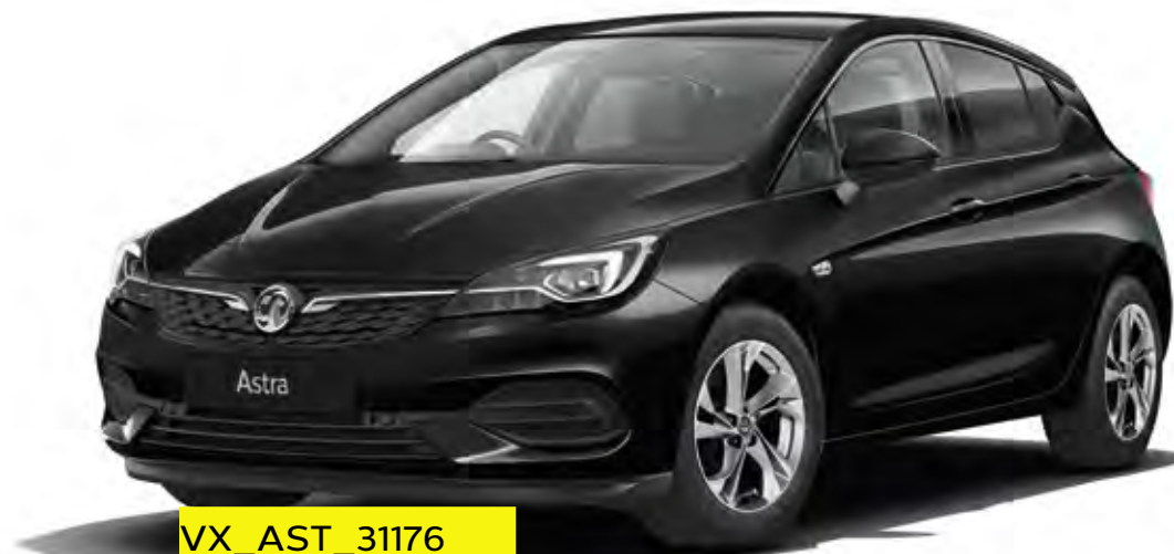
Mineral Black (GB9)† Two-coat metallic paint £550