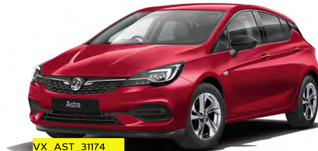
Hot Red (G1R)** Two-coat premium paint £650