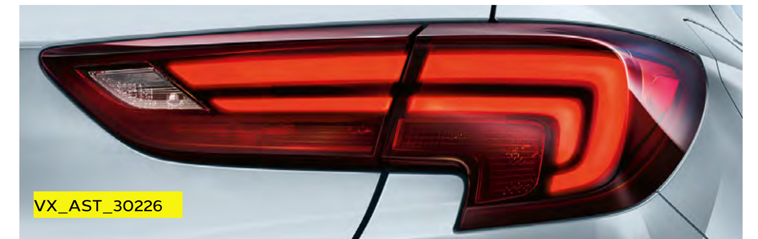
LED tail lights.