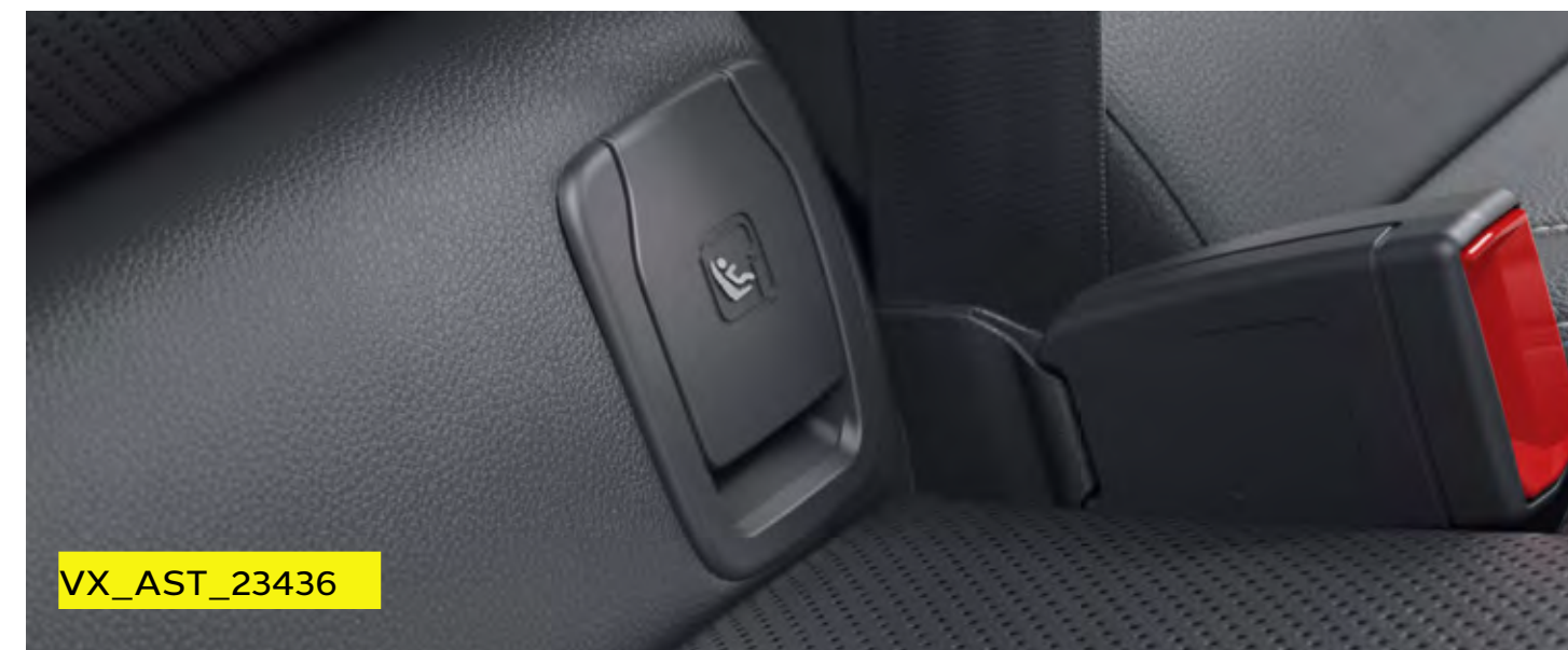
ISOFIX child seat mountings.