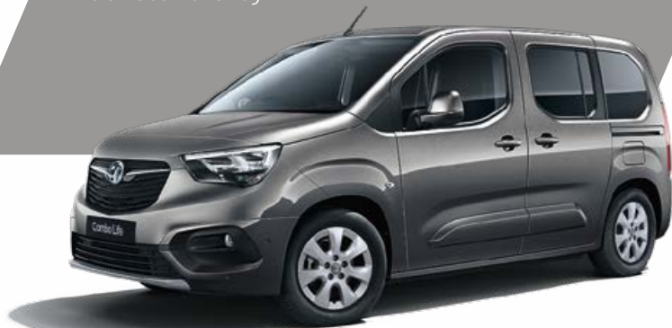
Moonstone Grey 3