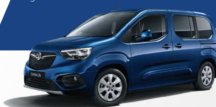
Night Blue 3