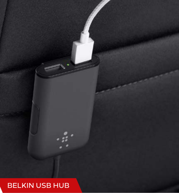
BELKIN USB HUB