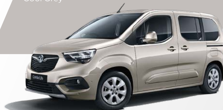
Cool Grey 3