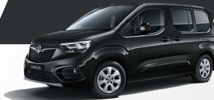
Onyx Black 1