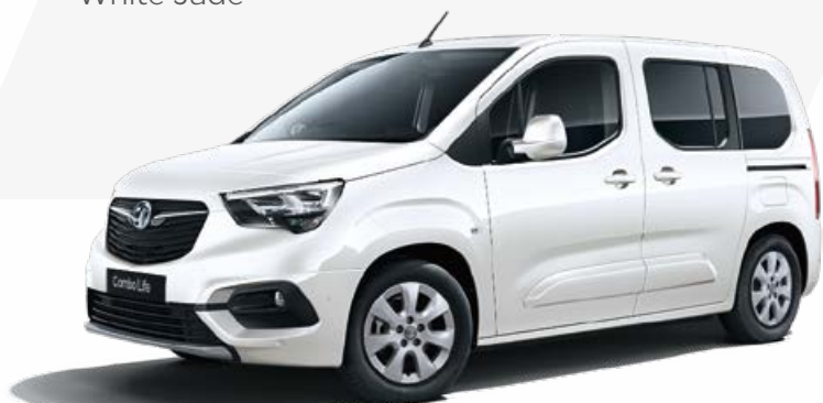
White Jade 1

So, you've picked your trim, your engine... even your rear seat configuration. Now it's time to choose your colour.