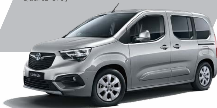
Quartz Grey 3