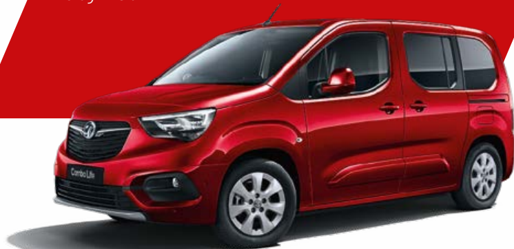
Ruby Red 2