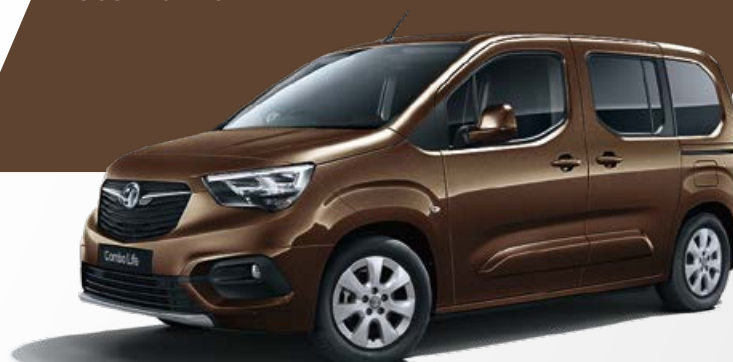
Cosmic Brown 4