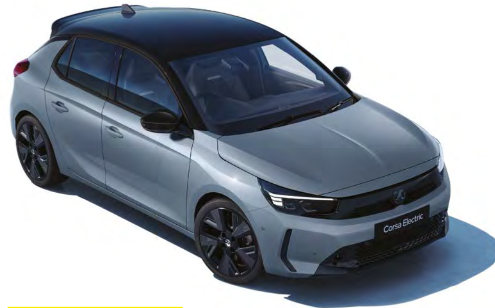
Graphic Grey (POSD)** Two-coat premium metallic paint £700