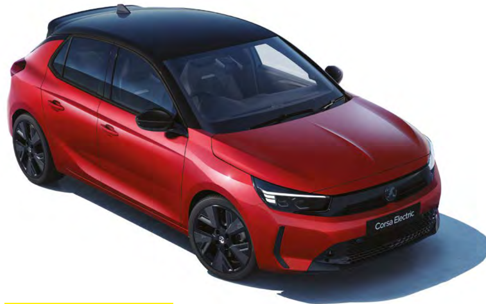
Crimson Red (MOPQ)** Two-coat premium metallic paint £700