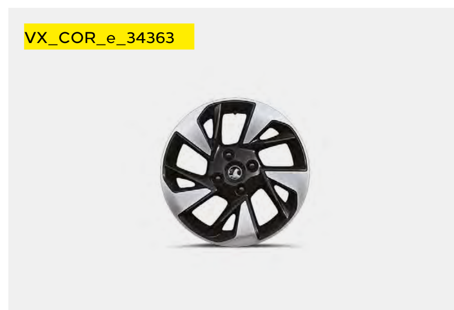
16-inch alloy wheel.