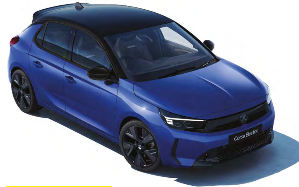
Voltaic Blue (MOAV)** Two-coat metallic paint £600