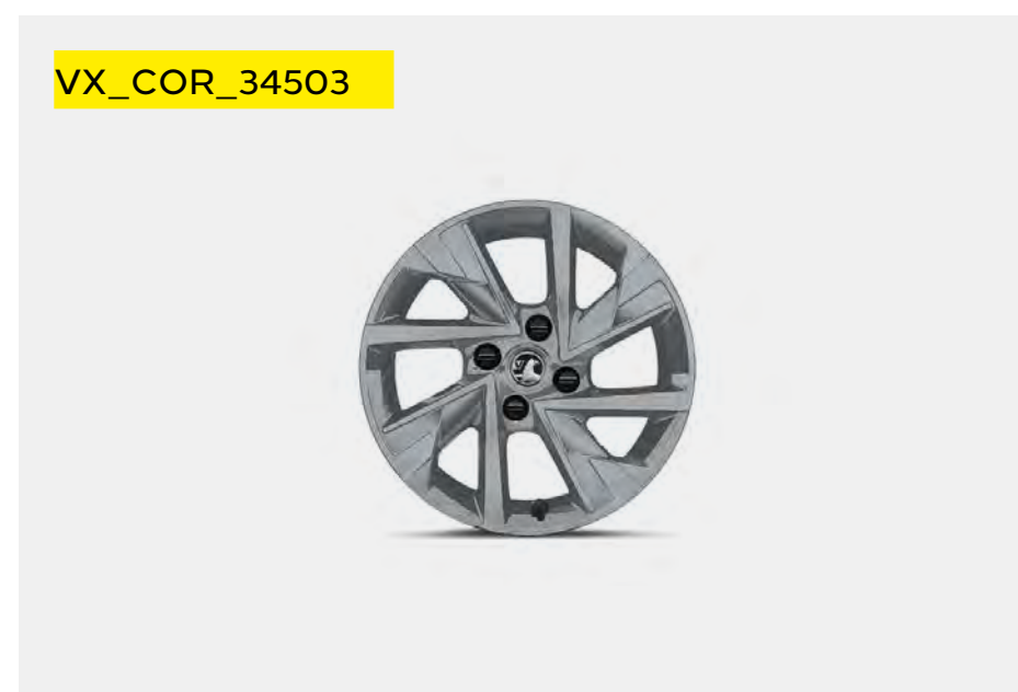
16-inch alloy wheel.