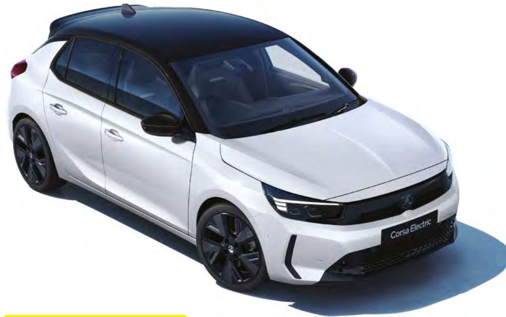
Arctic White (POWP)* Brilliant paint