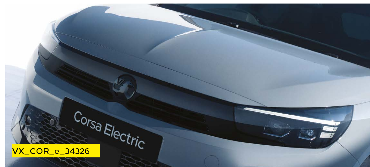
Black Griffin logo and vizeror frame.