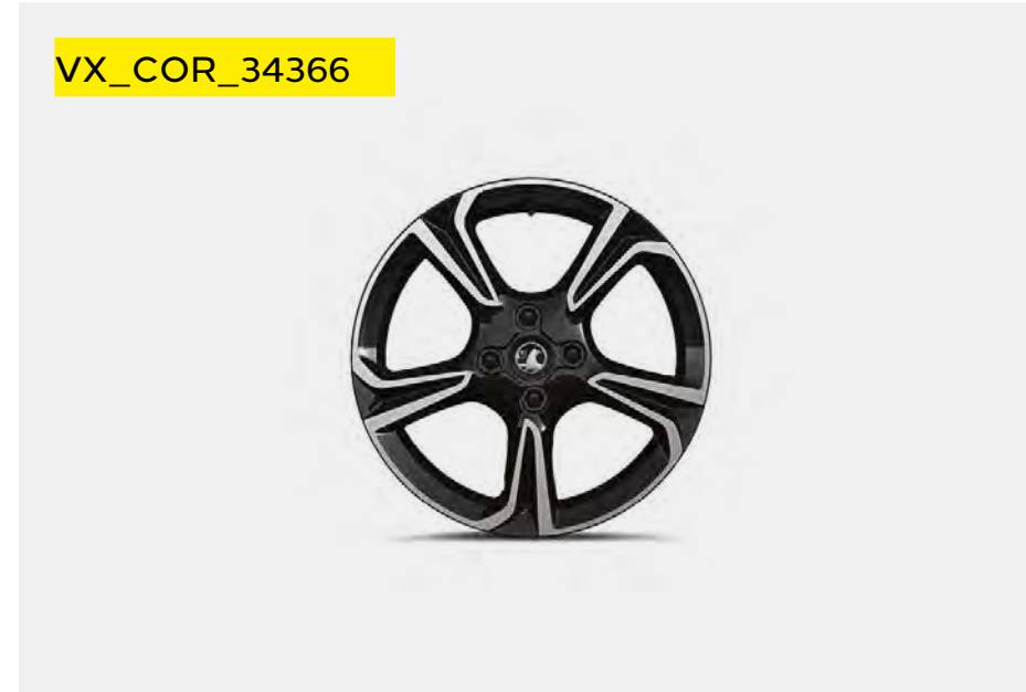
17-inch alloy wheel.