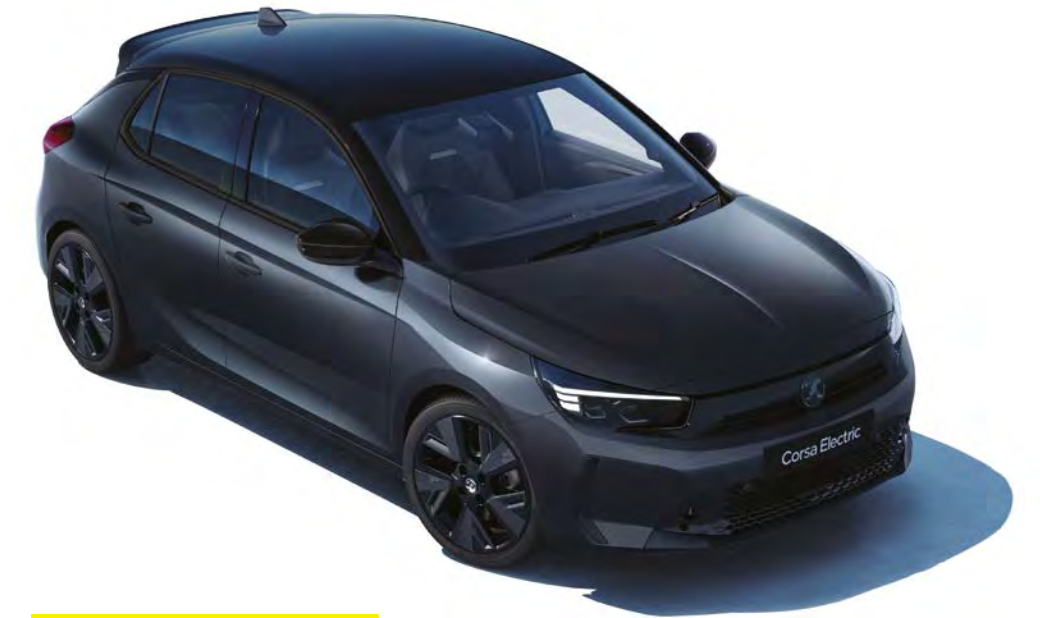
Carbon Black (M09V)** Two-coat metallic paint £600