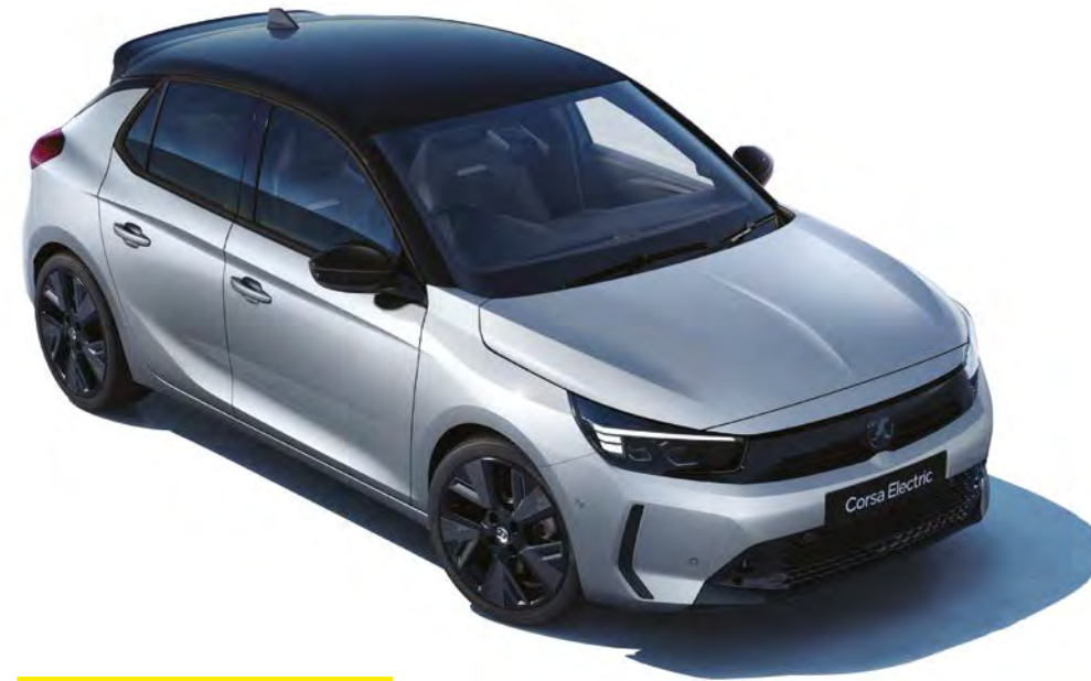
Crystal Silver (MOZR)** Two-coat metallic paint £600