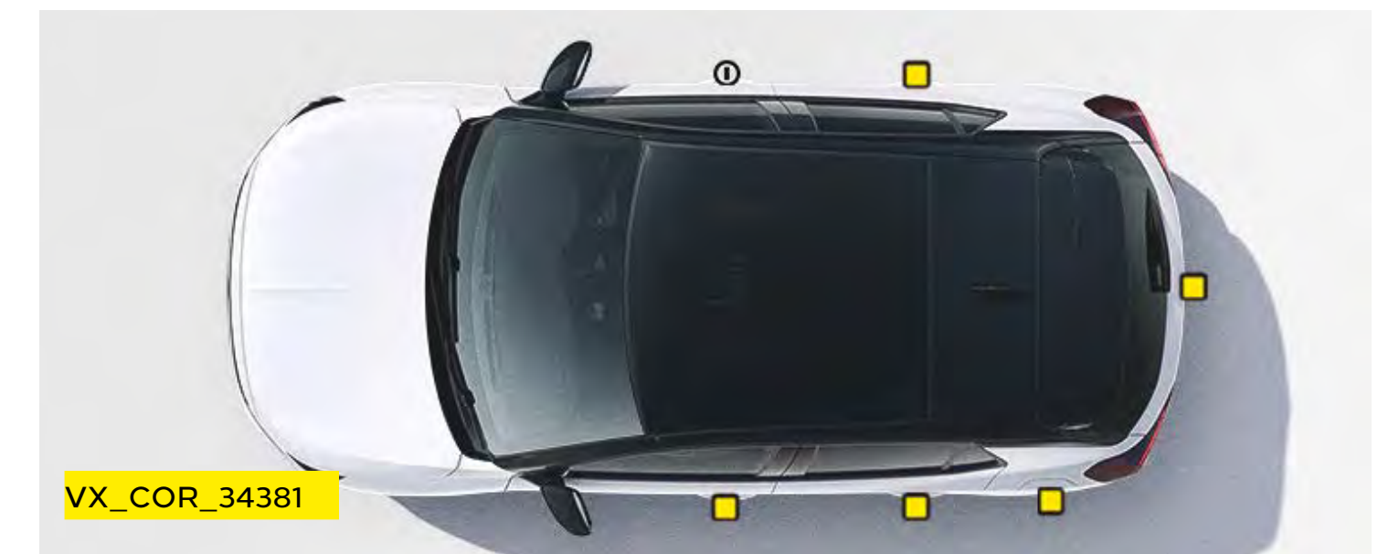
Remote control central locking.