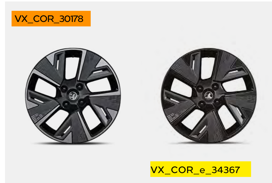
17-inch alloy wheel (Electric only).