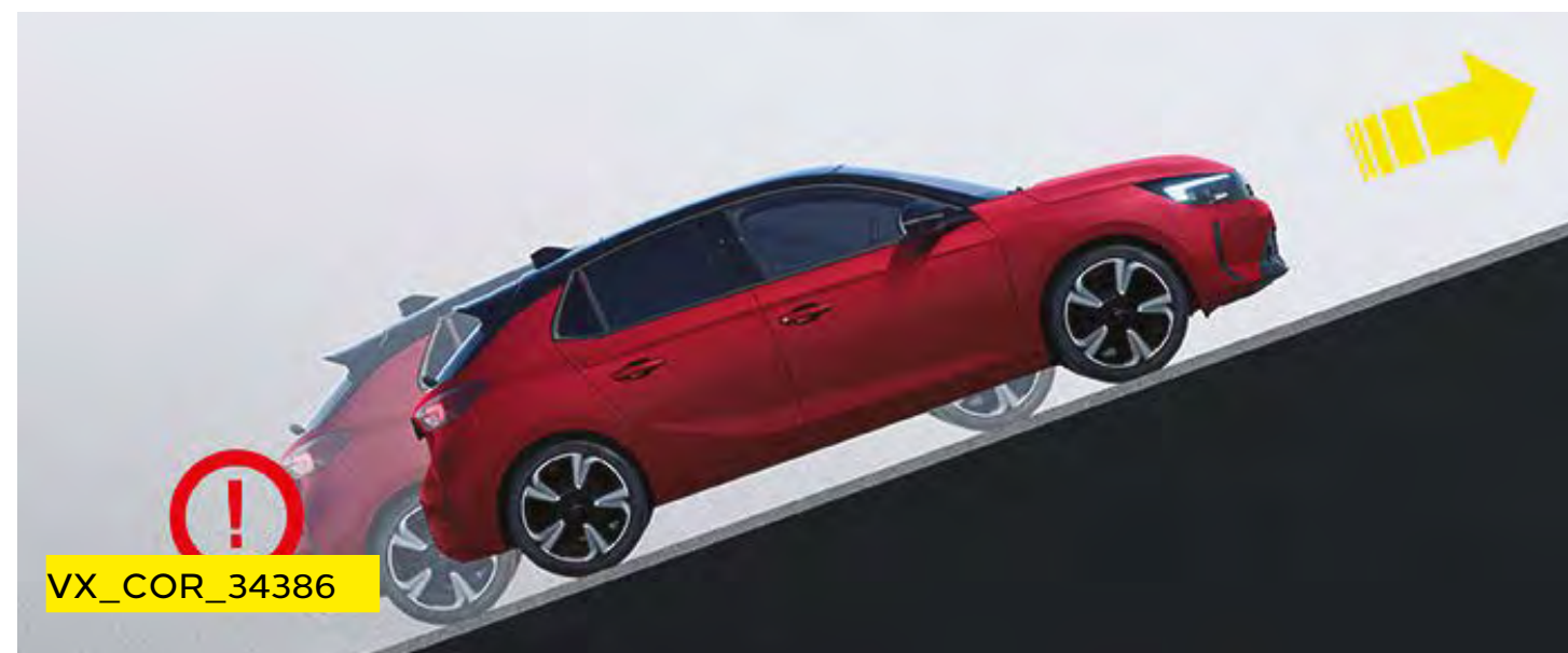
Hill start assist.