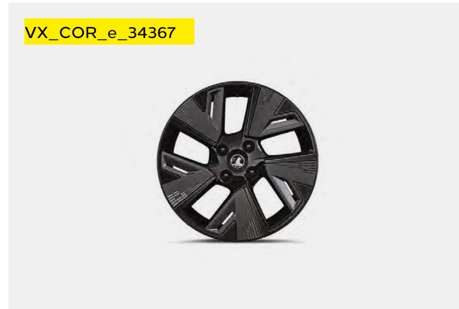
17-inch alloy wheel.