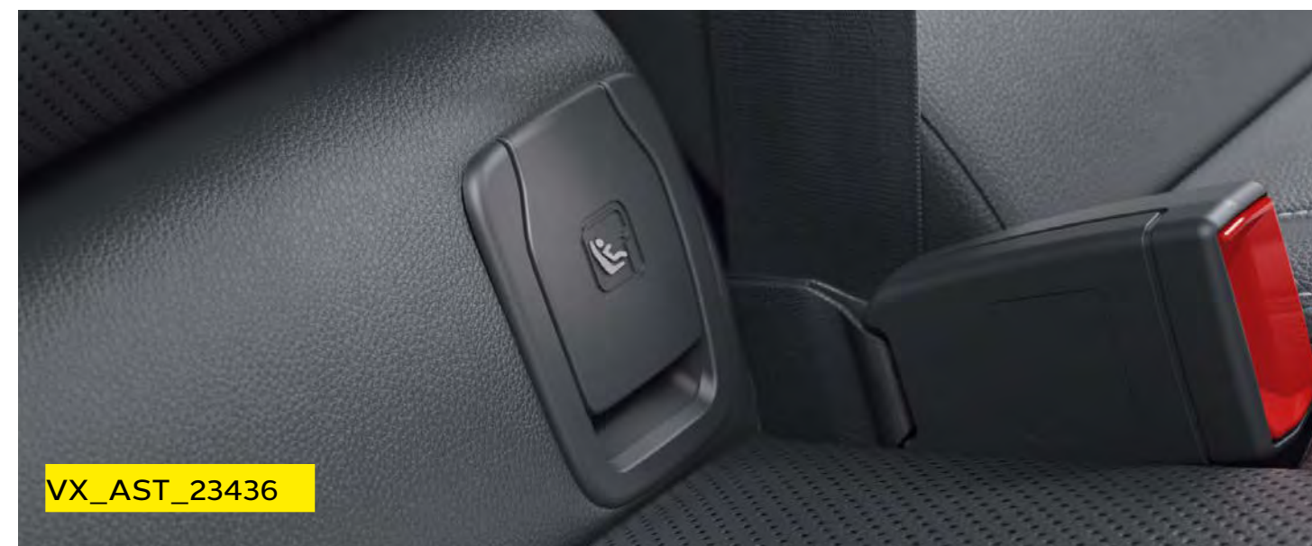
ISOFIX child seat mountings.