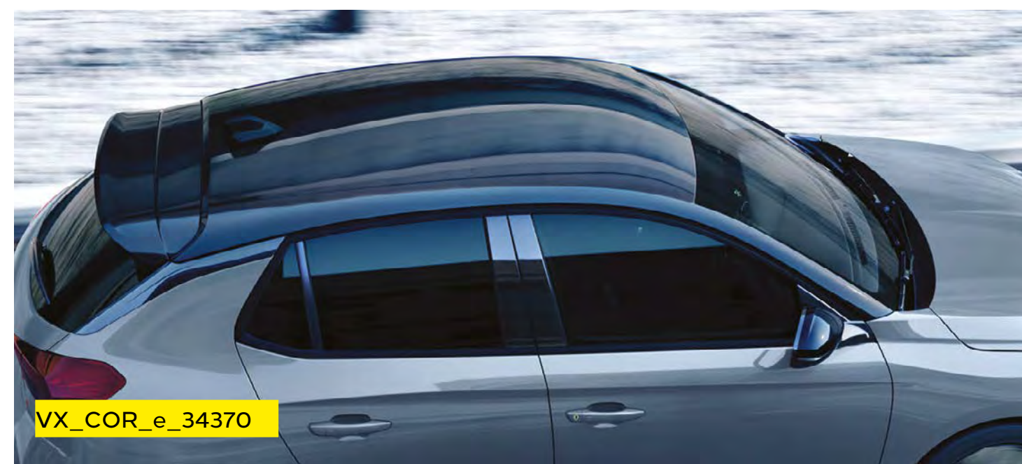
Black roof and dark-tinted rear windows.