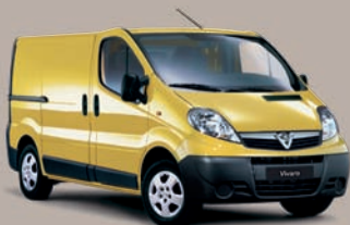
Corn Yellow – solid