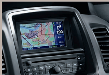
Satellite navigation Optional TomTom-based system features a useful remote control unit.