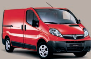
Flame Red – solid