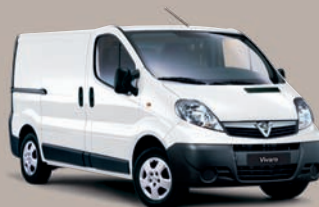
Glacier White – solid