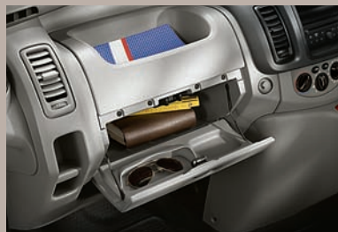
Improved storage A moulded recess above the glovebox creates additional storage space.