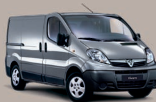
Steel Grey – metallic