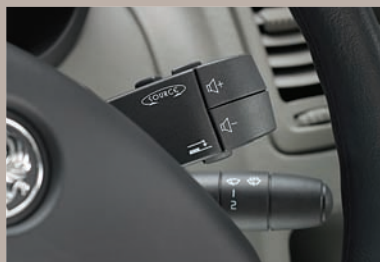
Steering column audio controls Standard on all Vivaro dropside models, enabling you to operate audio functions.

While a selection of practical options help you tailor your vehicle to your own individual needs.