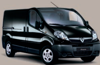
Midnight Black – pearlescent