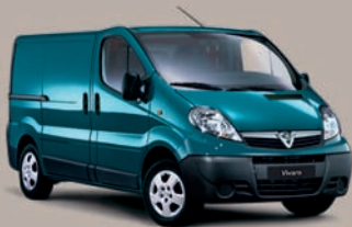
Adria – pearlescent