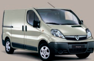
Sage – metallic