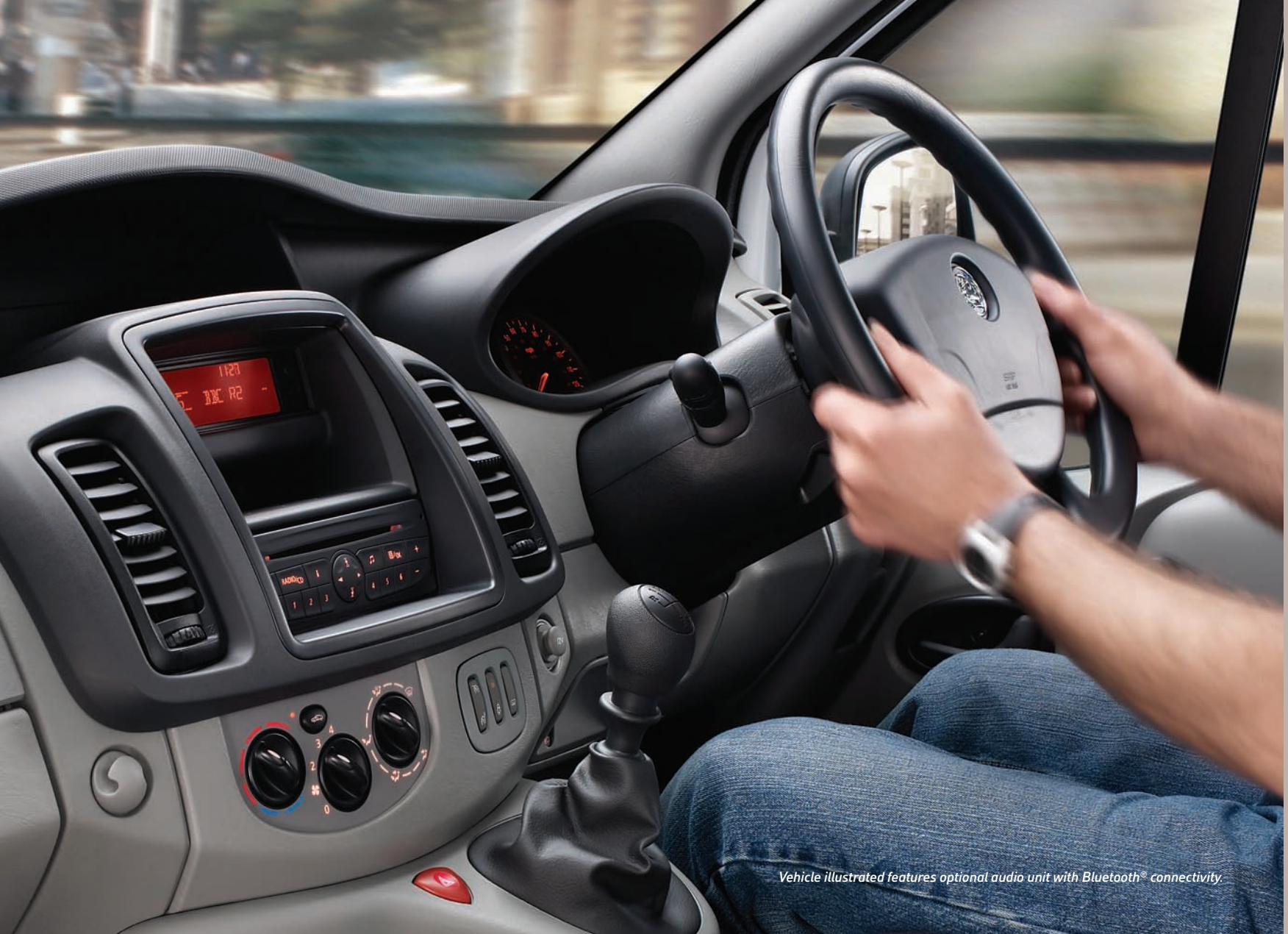
Vehicle illustrated features optional audio unit with Bluetooth® connectivity.