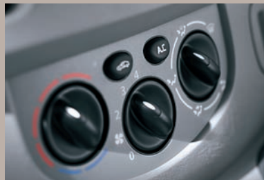
Optional air conditioning Helps maintain a constant temperature and helps clear windscreen of condensation in seconds.