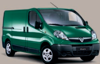
Ocean Green – metallic