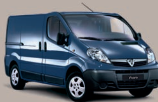
Panorama Blue – pearlescent