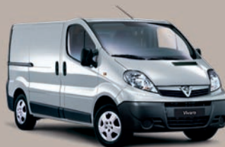
Star Silver – metallic