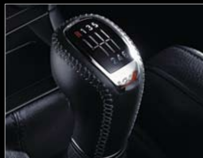
VXR gear knob.