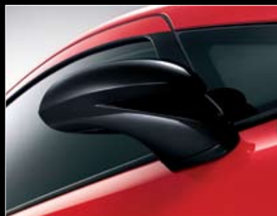
Unique black twin-arm door mirrors.