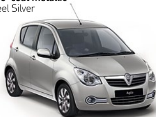
Two-coat metallic* Steel Silver