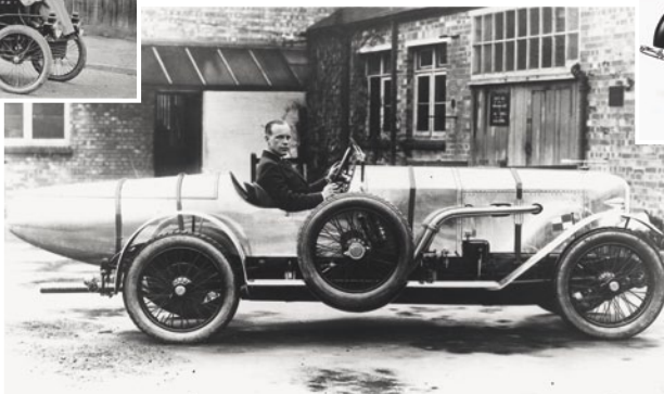
1922 – The Silver Arrow OE 30-98 was capable of speeds of over 100mph, this model was built for shipping magnate Sir Leonard Ropner to race at Brooklands.