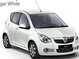
Two-coat pearlescent* Sugar White