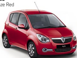
Solid Blaze Red