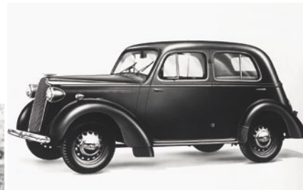
1937 – The Vauxhall 10' H-type, the first British car to have integral construction.