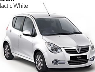
Brilliant* Galactic White