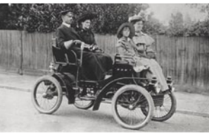
1903 – Forward thinking has been in our nature from the very start. The 6HP, our first ever car, had two forward gears. And no reverse.