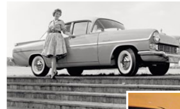
1957 – The PA Cresta introduced Americana styling to the UK.