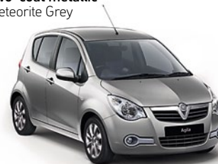
Two-coat metallic* Meteorite Grey