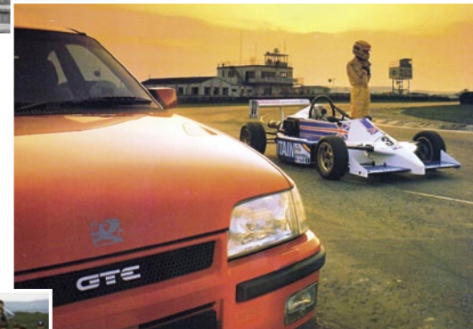
1984 – The MkII Astra introduced class-leading aerodynamic styling that still looks good today. The Formula Vauxhall Lotus ran a modified version of the Astra GTE's 2.0i 16v engine.