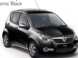
Two-coat pearlescent* Cosmic Black