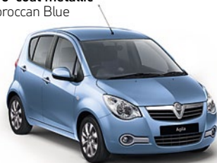
Two-coat metallic* Moroccan Blue