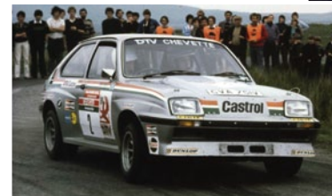
1971 – The formation of Dealer Team Vauxhall (DTV). The track car was the precursor to our enormous success in touring car racing.