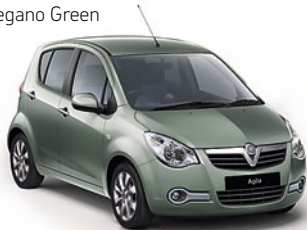
Two-coat metallic** Oregano Green