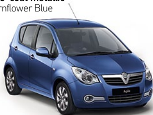
Two-coat metallic** Cornflower Blue