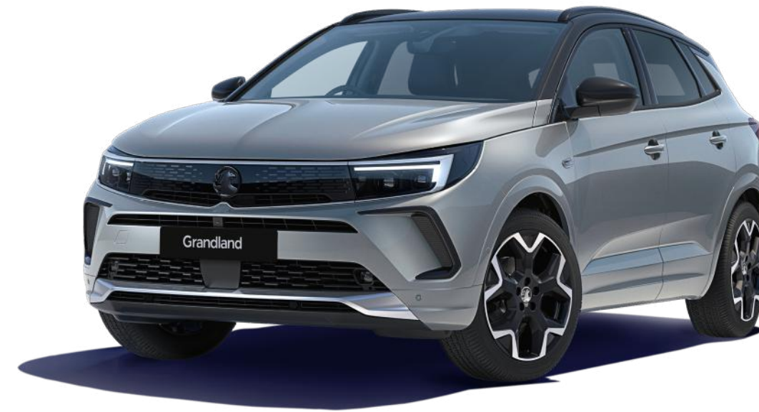
Contrast Grey (OMMO/ONF4)** Two-coat metallic paint £600