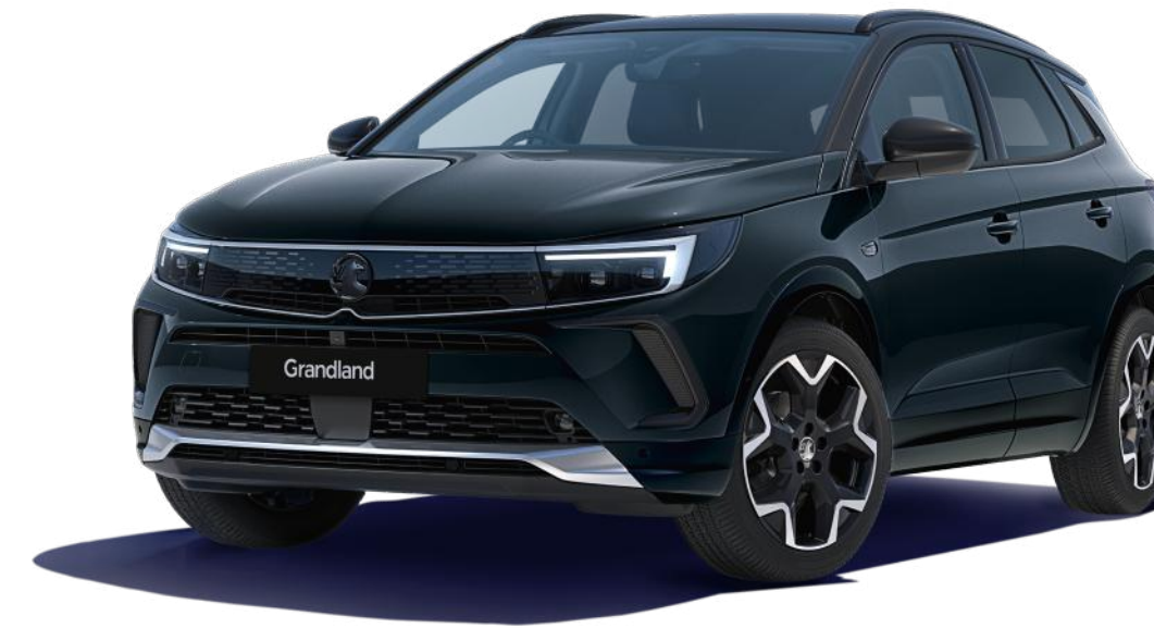
Carbon Black (OMMO/ON9V)** Two-coat metallic paint £600