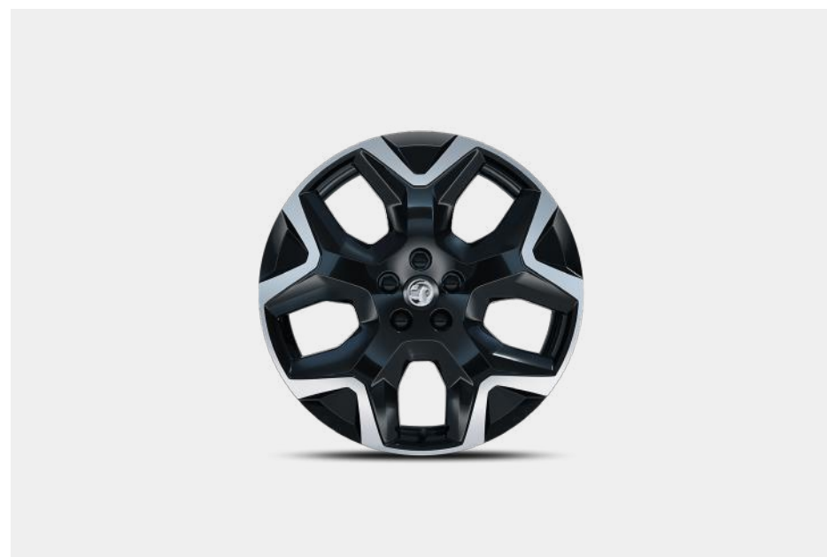
19-inch alloy wheel.