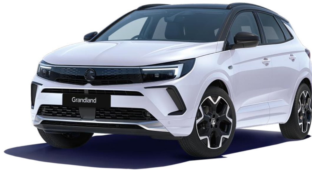
Arctic White (OMPO/ONWP)* Brilliant paint