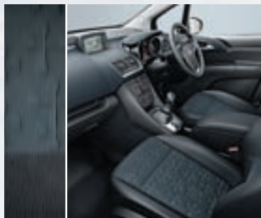
Astor cloth/Morrocana – Black Standard on SE models.

†Not available on Flame Red, Silver Lake and Oriental Blue.