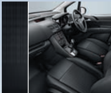
Pepe cloth – Black Standard on Expression/S models.