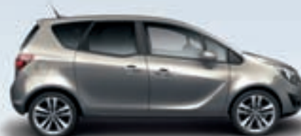
Pepperdust – Metallic*