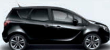
Black Sapphire – Pearlescent*