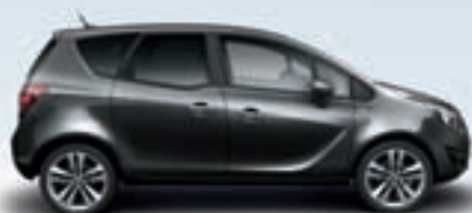
Technical Grey – Metallic*