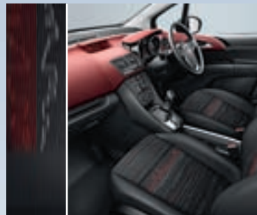
Skyline cloth – Red** Optional at no cost on Exclusiv models.