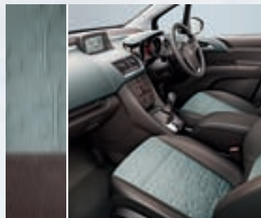
Astor cloth/Morrocana – Cocoa†† Optional at no cost on SE models.