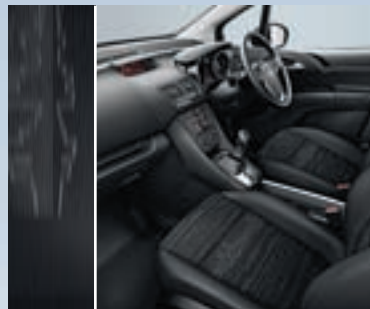
Skyline cloth – Black Standard on Exclusiv models.