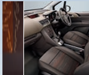
Skyline cloth – Orange† Optional at no cost on Exclusiv models.

**Not available on Technical Grey, Silver Lake, Pepperdust and Oriental Blue.