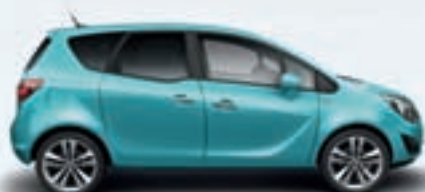
Oriental Blue – Pearlescent*