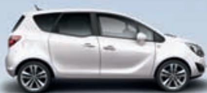
Glacier White – Solid