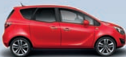
Flame Red – Solid