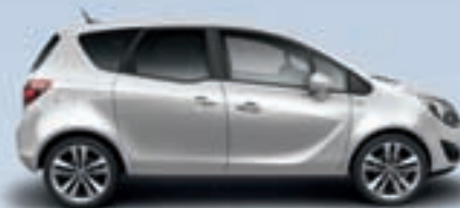
Star Silver – Metallic*