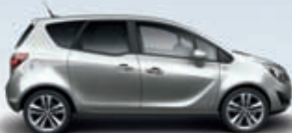
Silver Lake – Metallic*