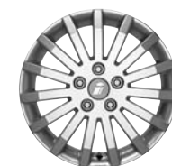
Signa 6.5J x 16 £811 8J x 18 £1590