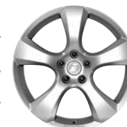
Evo Star 7.5J x 18 £1590 Insignia 8.5J x 20 £2040 Antara 8.5J x 20 £2066

Please note: Fully fitted price, excluding tyres, includes static wheel balancing. Fitting larger diameter wheels than standard will require the fitting of new tyres at extra cost. Many other styles and finishes are available, see www.vauxhall-accessories.com for details.