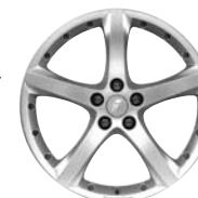
GT Star 6.5J x 16 £811 8J x 19 £1923