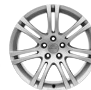
Stila 6.5J x 15 £733 6.5J x 16 £811 8J x 18 £1590