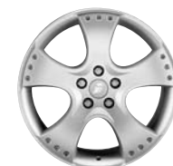
Sport Star 7J x 17 £1304 18 8J x 18 £1808