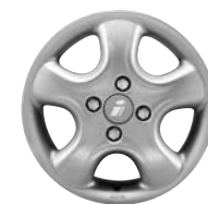
Softstar 6J x 14 £663

* = Prices shown are a special fully fitted (and painted, where applicable) price at participating retailers only. Please check with your local Vauxhall retailer for details. All other prices exclude fitting. It is advisable to ensure your insurance policy is adequate to cover additional fitted accessories. Prices correct at time of publication.